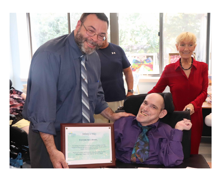
Individuals supported by UCP of Long Island in New York.

Out of necessity, providers began incurring unthinkable overtime costs. According to the aforementioned survey, more than half (52%) of