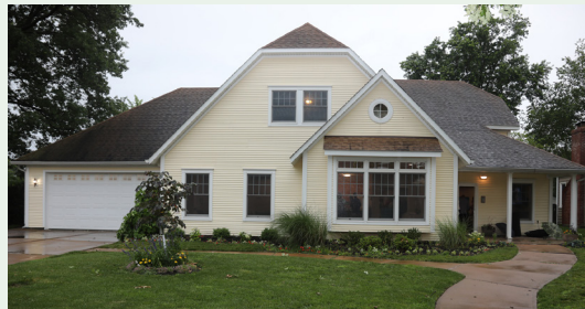
Oak Tree Respite

450 Oak Tree Dr. St. Louis, MO 63119 (314) 962 - 0015